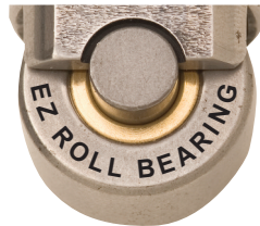
ISKY's Revolutionary New Wide Foot Print Low Friction EZ-Roll Bearing!